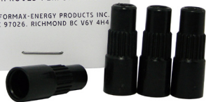
PEP Tire Valves

Engine electro magnetic block vinyl tag Place in glove box wall.