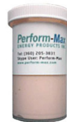
PEP Paint Polish Used on head lights