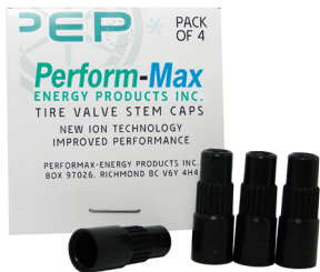
PEP Tire Valves