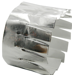
PEP Exhaust Tape Used on pipes, hoses and aluminum/ chrome rims